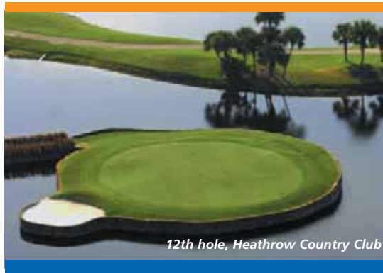
12th hole, Heathrow Country Club

Scramble Format Registration 10:30 am Shotgun Start 12:00 pm Awards Dinner and Auction 5:00 pm